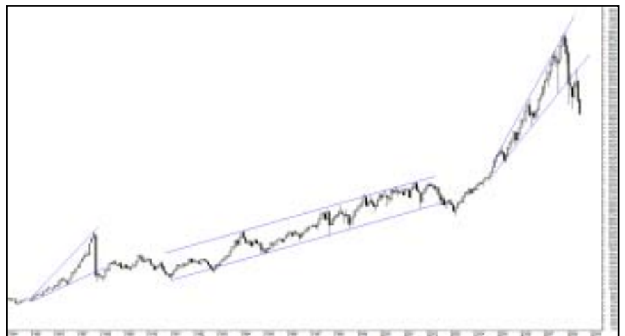
Australian All Ordinaries Index Monthly Chart